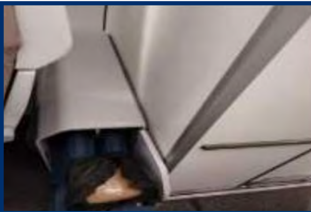
1.36 Kg of Heroin worth around Rs 20,400,000