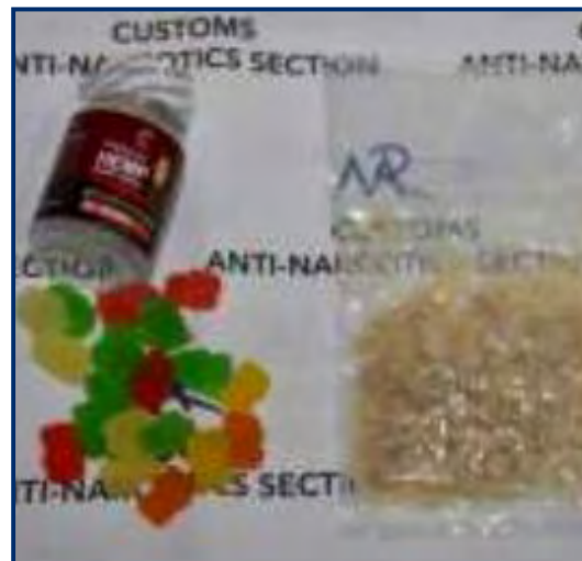
MDMA worth about Rs 829,500