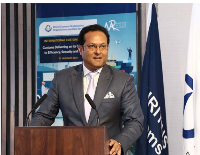
Honourable Dhaneshwar Damry, Junior Minister of Finance