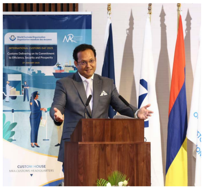
Honourable Dhaneshwar Damry, Junior Minister of Finance

The Director-General further emphasized that MRA is fully committed to supporting the Government's economic reforms and development initiatives. As a humble servant of the nation, MRA is dedicated to advancing the country in alignment with its motto: "Partners in Progress."