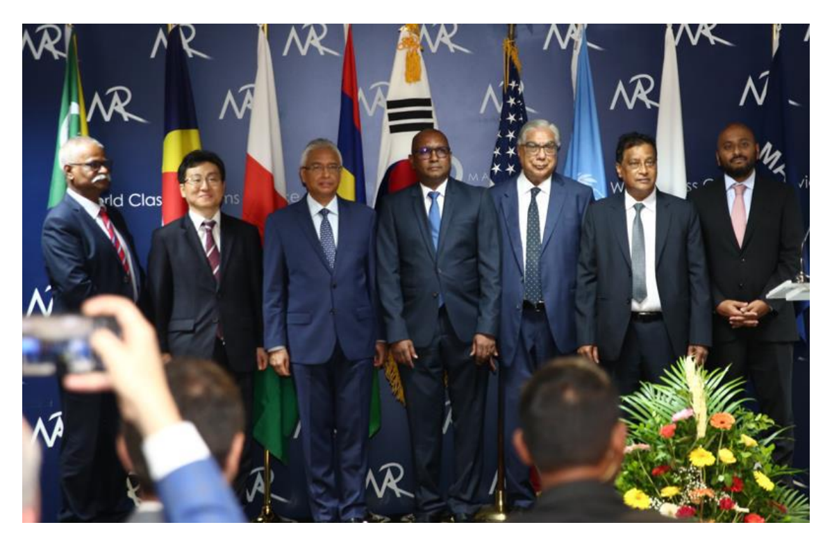
Many eminent personalities were present for the launching of the Port Surveillance Command centre

He is convinced that "the logical response to such a challenge is to build the capacity of our law enforcement officers in the fight against transnational crimes".