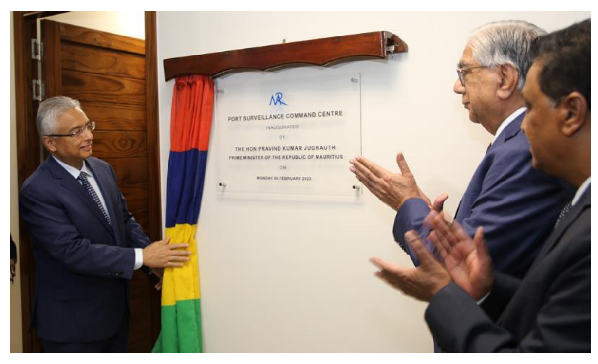
The Prime Minister inaugurated the Port Surveillance Command Centre at the Custom House in Mer Rouge

The Prime Minister of the Republic of Mauritius, Hon. Pravind Kumar Jugnauth, inaugurated the Port Surveillance Command Centre at MRA Customs on Monday 06 February, 2023, in the presence, amongst Dr. the Honourable Renganaden Padayachy, Minister of Finance, Economic Planning and Development, the Chairperson and Director-General of the MRA. This SADC-funded project necessitated an investment of more than Rs 20 million.