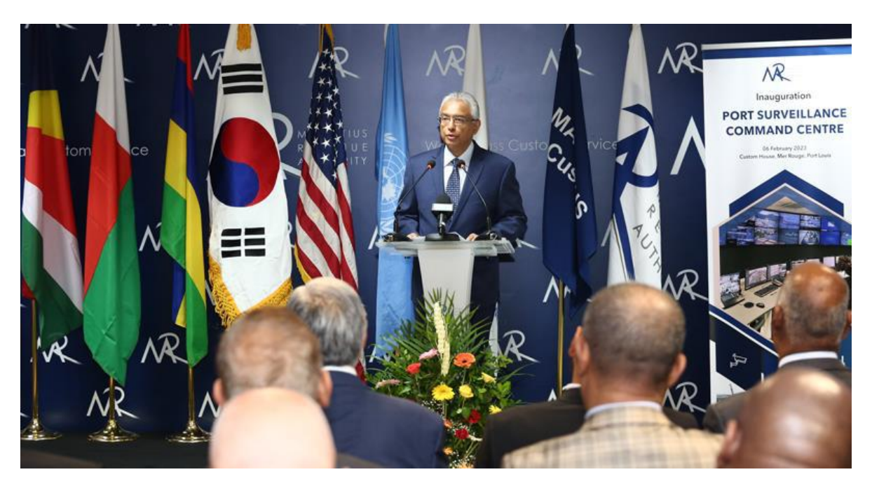
Hon. Pravind Kumar Jugnauth, the Prime Minister of the Republic of Mauritius

The Prime Minister mentioned that "drugs have devastating consequences on the health and safety of our people as well as the security and economic development of our nation". It is also closely linked to other illegal activities, and its proceeds are used to finance diverse criminal activities by organised criminal groups and terrorists, he said. He observed that "threats to the general public are increasing with illicit drugs being more available and accessible than ever before due to a steady rise in online sales and contactless delivery methods".